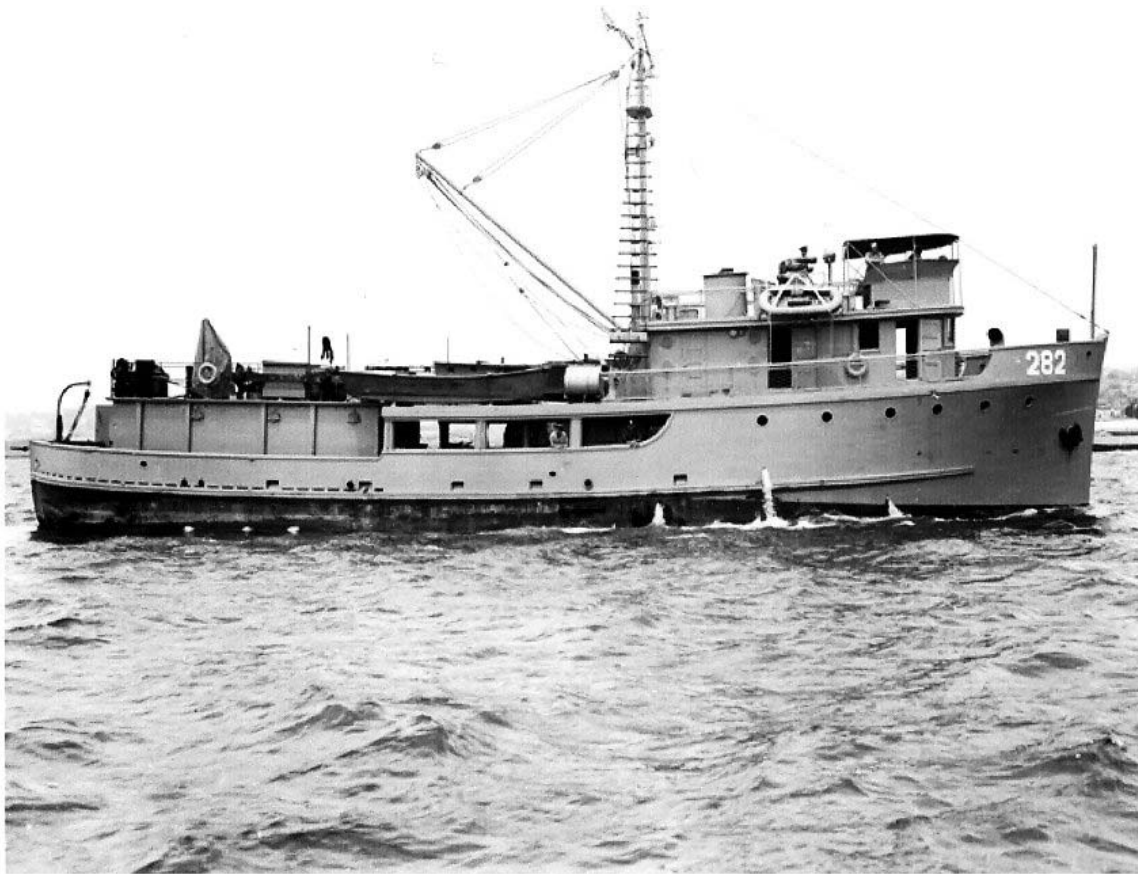
YP-282, the former Yvonne Louise.

Other boats and crews were welcomed home as heroes after the war ended in August 1945. The Azoreana , Victoria , Normandie , and other veterans would lead the tuna industry to unprecedented prosperity in the 1950s when San Diego emerged as the “Tuna Capital of the World.”